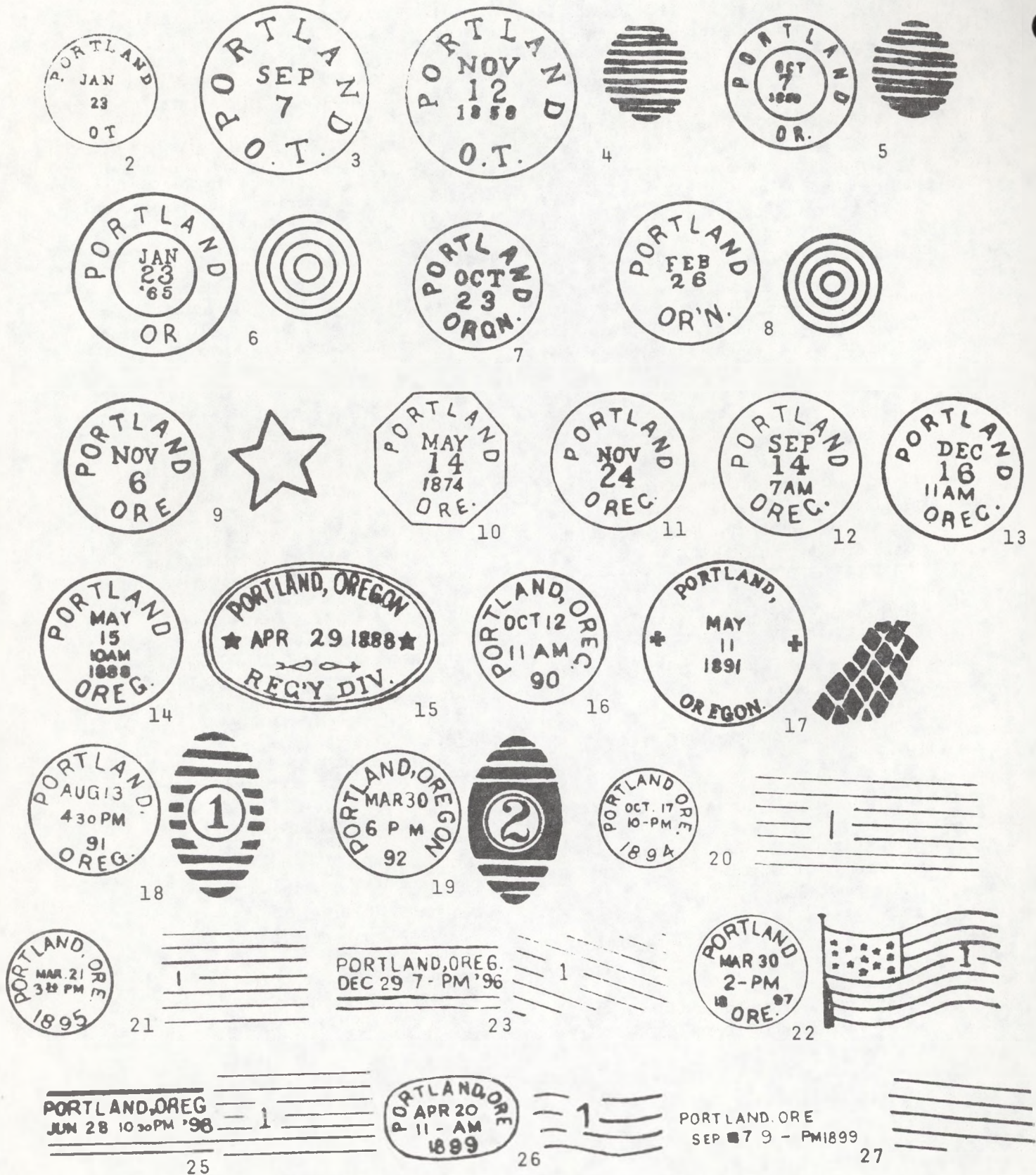
PORTLAND POSTMARK TYPES (1852 - 1900)